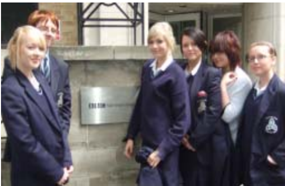
Year 11 Media Studies visit to BBC Broadcasting House, Belfast in June